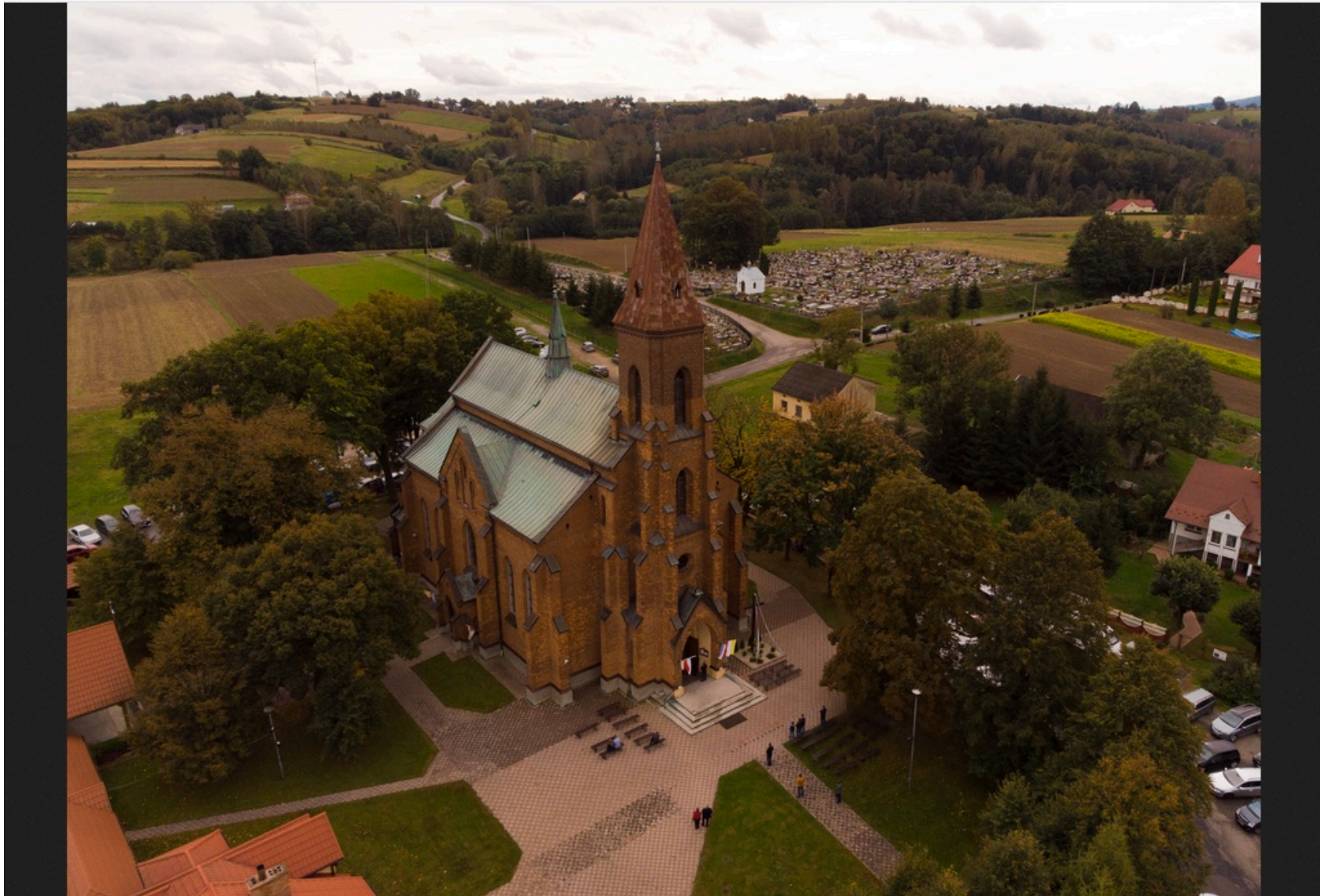
Present-day Catholic Church in Przemyska Parafia rzymskokatolicka pw. Najświętszej Maryi Panny Wniebowziętej Cemetery is located in the background